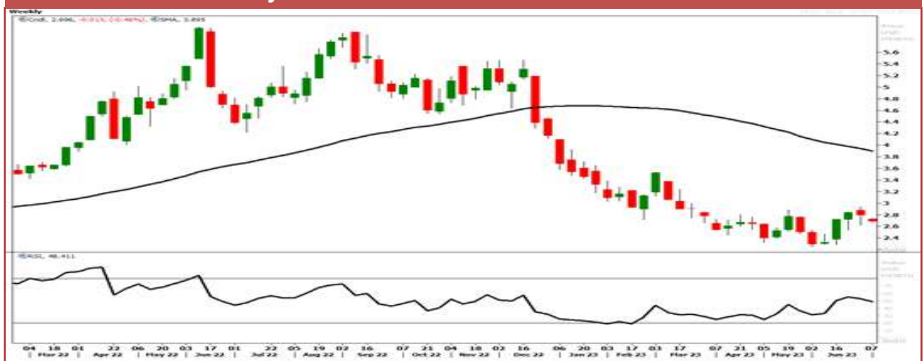
Weekly Price Movement of Natural Gas in NYMEX