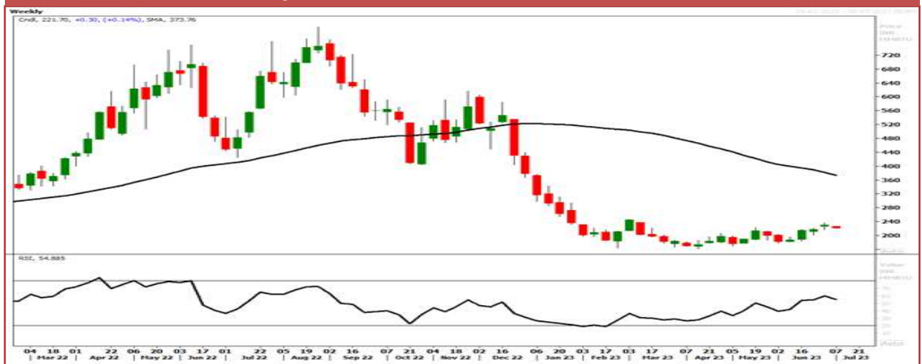
Weekly Price Movement of Natural Gas in MCX